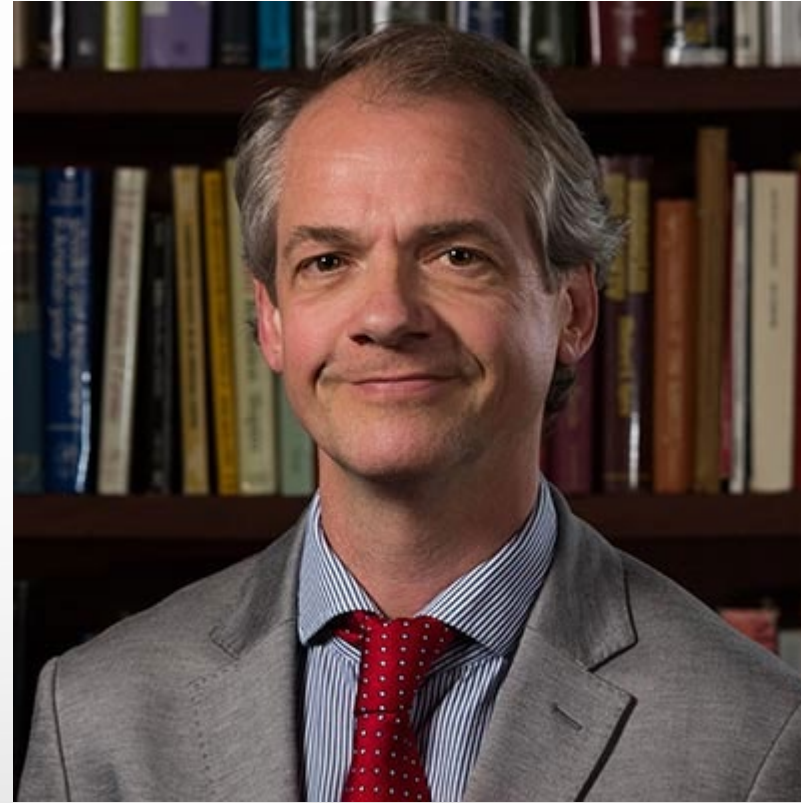
STEFAN G. HOFMANN (USA)

PROCESS-BASED COGNITIVE BEHAVIORAL THERAPY