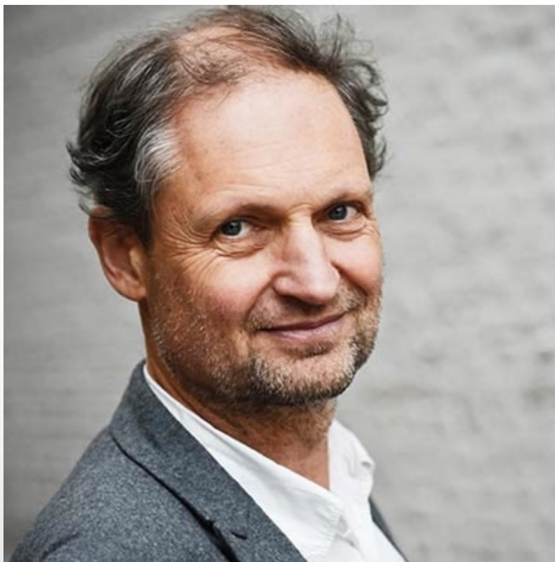
ARNOUD ARNTZ (NETHERLAND)

SCHEMA THERAPY FOR CLUSTER-C PERSONALITY DISORDERS